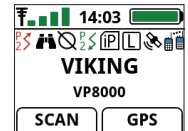
Day - High Contrast